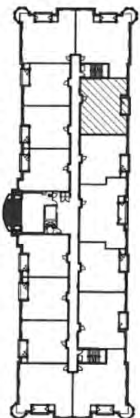
KEY PLAN - SECOND LEVEL