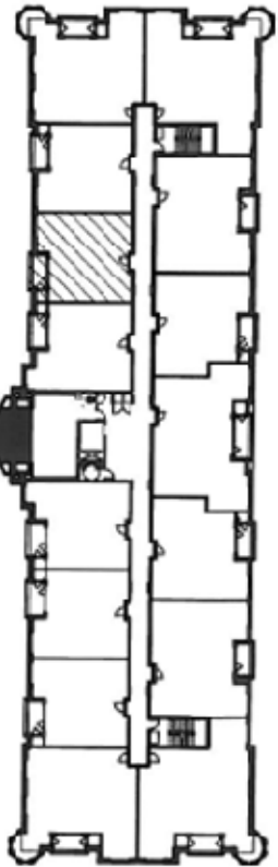
KEY PLAN - SECOND FLOOR