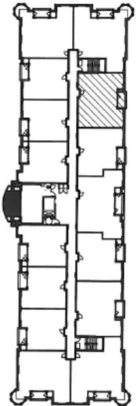
KEY PLAN - SECOND LEVEL